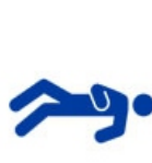
LOSS OF CONSCIOUSNESS